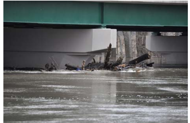
(Hwy 41 Bridge -)

Scott Co Rd 9 and Carver County 11 near Jordan Hwy 101 Near Shakopee Hwy 41 In Chaska