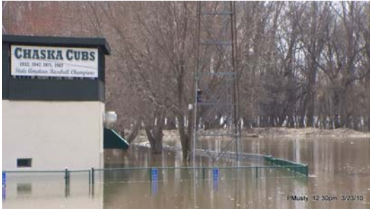
Athletic Park – March 2010

the area a destination for our community and the surrounding area. The City of Chaska thanks our former leaders who paved the way to completing the flood control project and recognized the significant impact to the community.