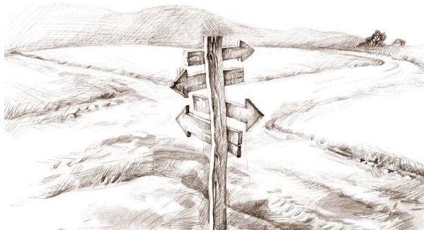
Chaska CityHall Bulletin