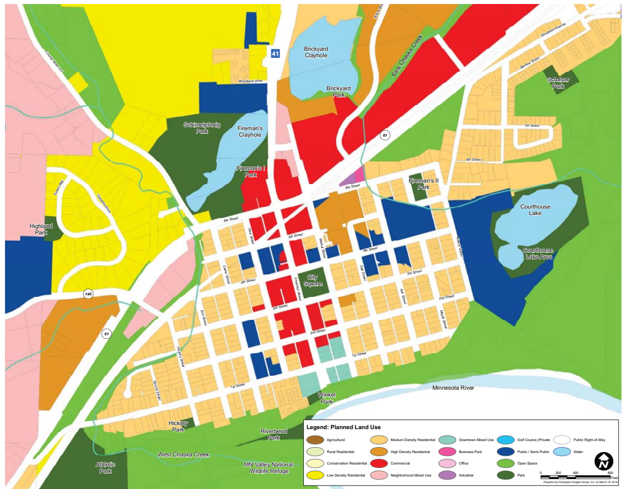
Figure XX. Chaska 2030 Planned Land Use